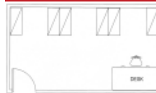
Cabinets or Shelving