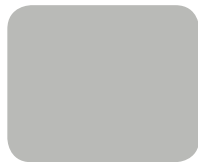
161 Mist Gray